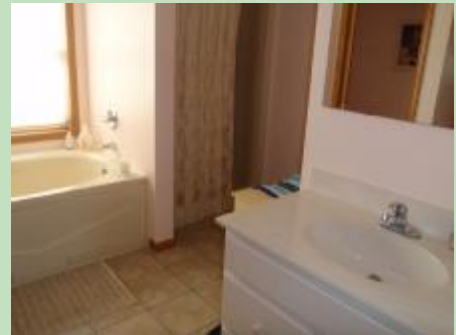
Views of master bath