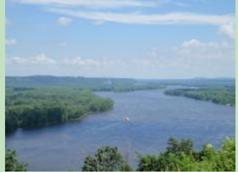
View of Mississippi from yard