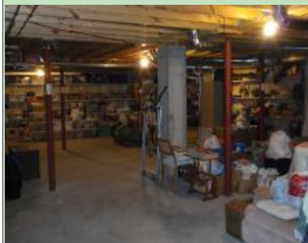
Storage area in basement