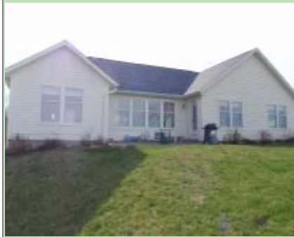
Rear-view of home