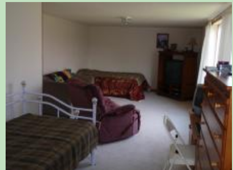
Bedroom in basement