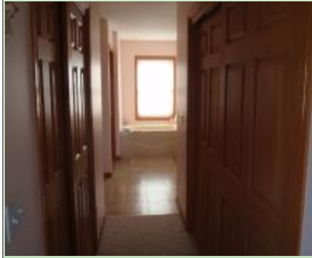
Closet area in master bedroom