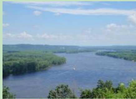
Other views of the majestic Mississippi River from back yard