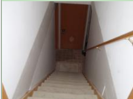
Steps to basement