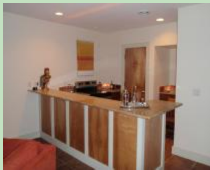
Lower level bar/kitchenette