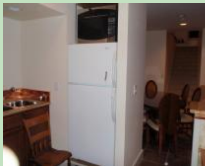
Lower level bar/kitchenette