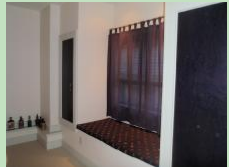
Main level hallway to lower level