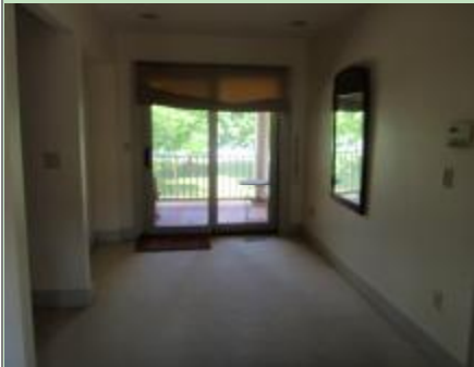
Upper level lounge-river view