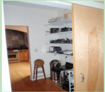
Walk-thru pantry/storage closet