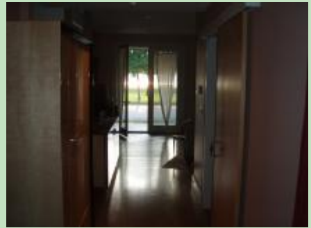
View out of front door on main level