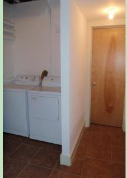
Lower level utility area