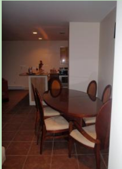
Lower level entertainment area