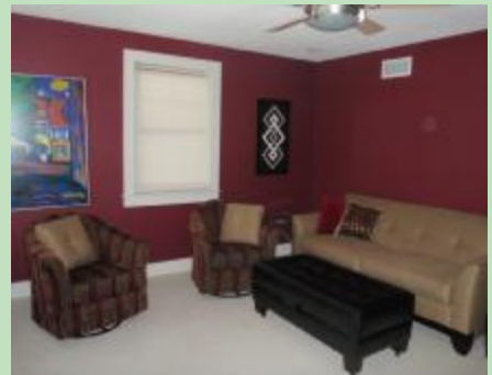
Main floor den