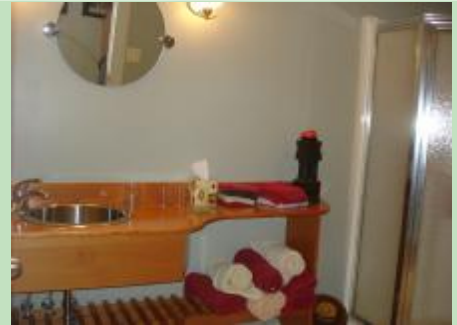
Upper level full bath