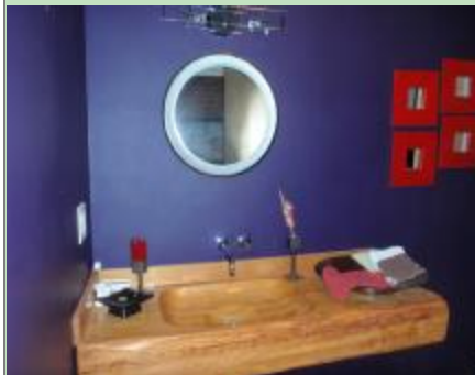
Main level quarter bath