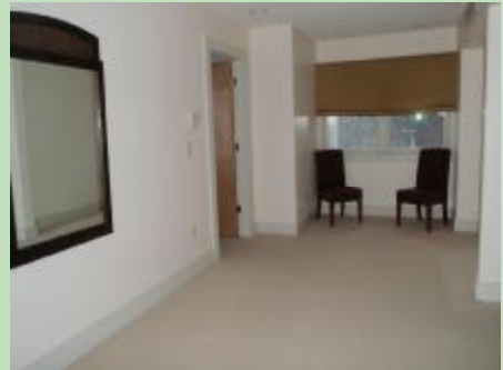
Upper level lounge-bluff view