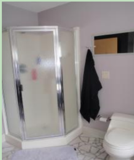
Shower in Master Suite