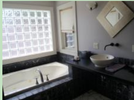
Full Bath in Master Suite