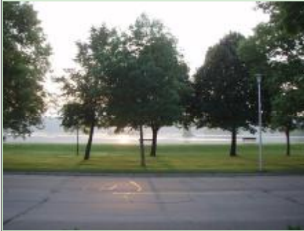
View of Mississippi off Veranda