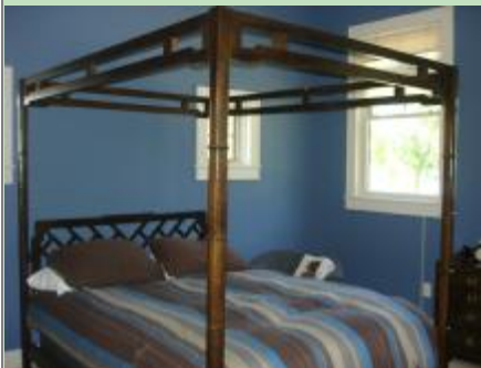
Upper floor bedroom facing Mississippi River with veranda access