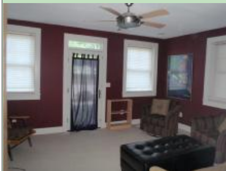
Main floor den