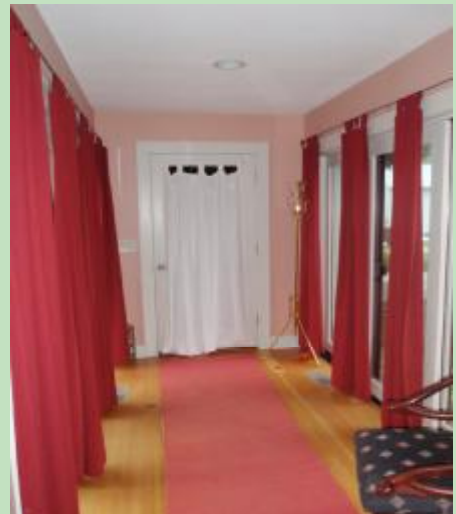
Hallway to patio & garage