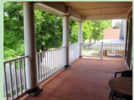
Veranda off of Master Suite