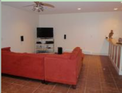
Lower-level family room