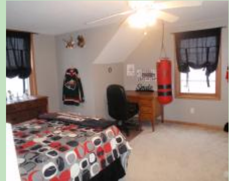
Another Second-floor bedroom