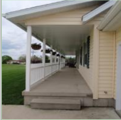
Covered Front Porch