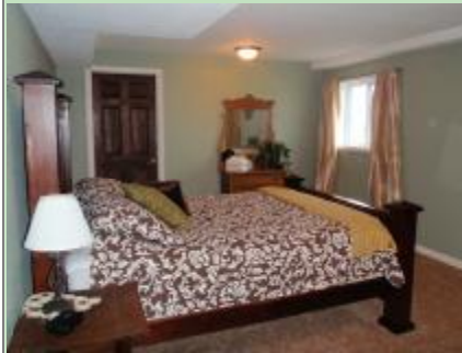
Lower level w/walk-in closet