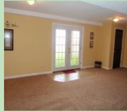
Patio doors in basement