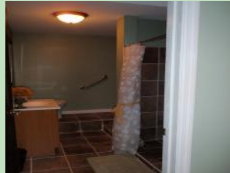
Lower-level Full Bathroom