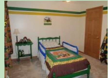
2 nd bedroom/main floor