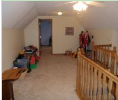
Upstairs Common Area