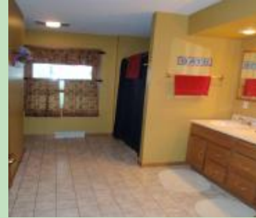
Bathroom in Master Suite