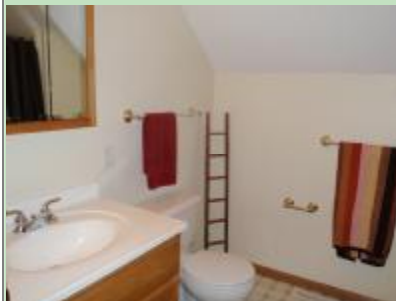
2 nd Floor Bathroom