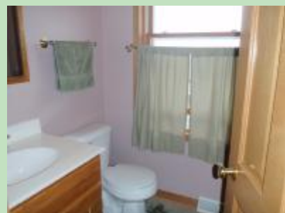
Half-Bathroom Main Level