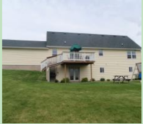
View of rear of house and deck